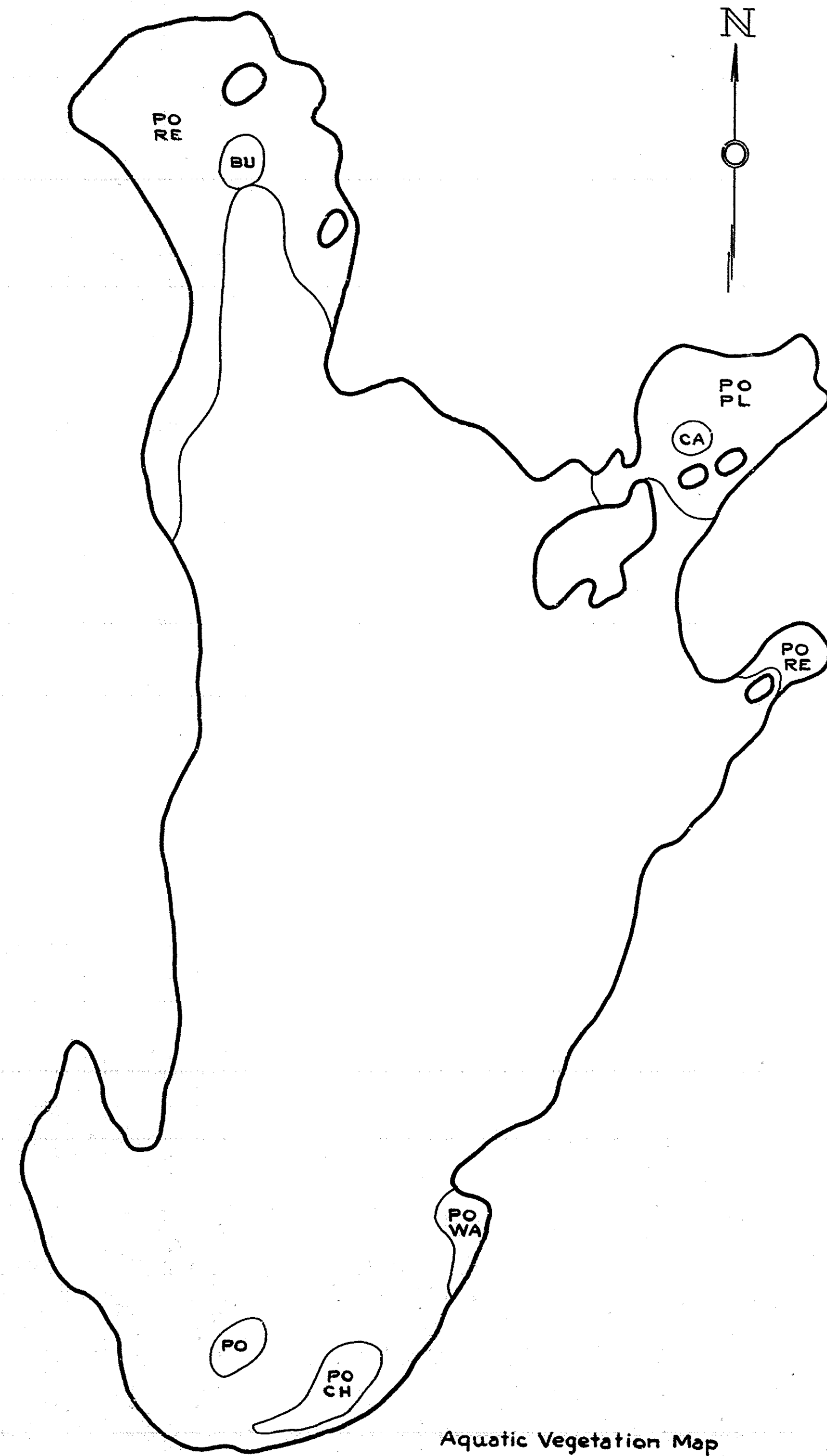
Aquatic Vegetation Map

Area- Acres Length of Shore Line-6.2 Miles