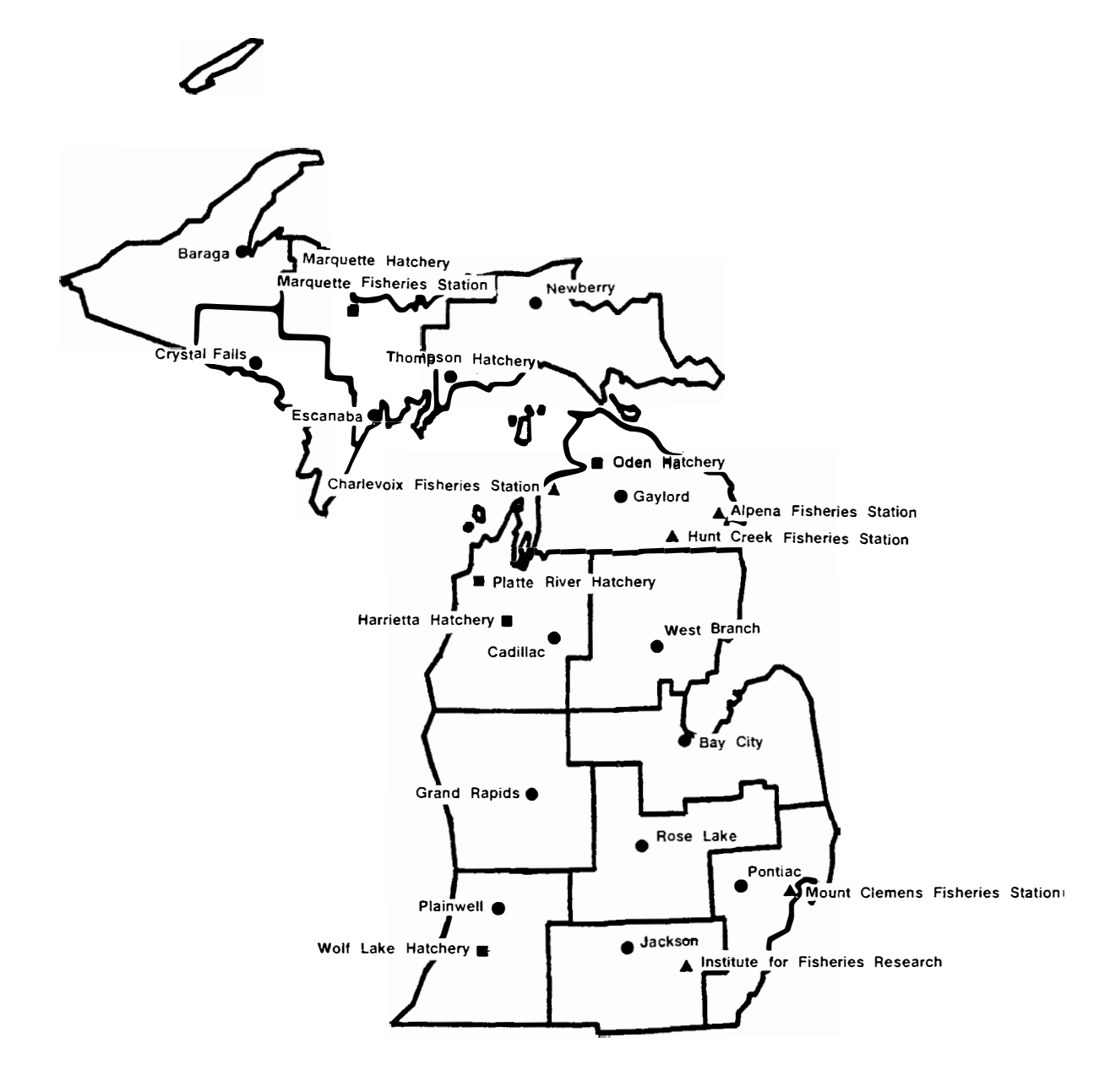
Figure 1. Michigan's fisheries management districts, hatcheries, and fisheries stations.