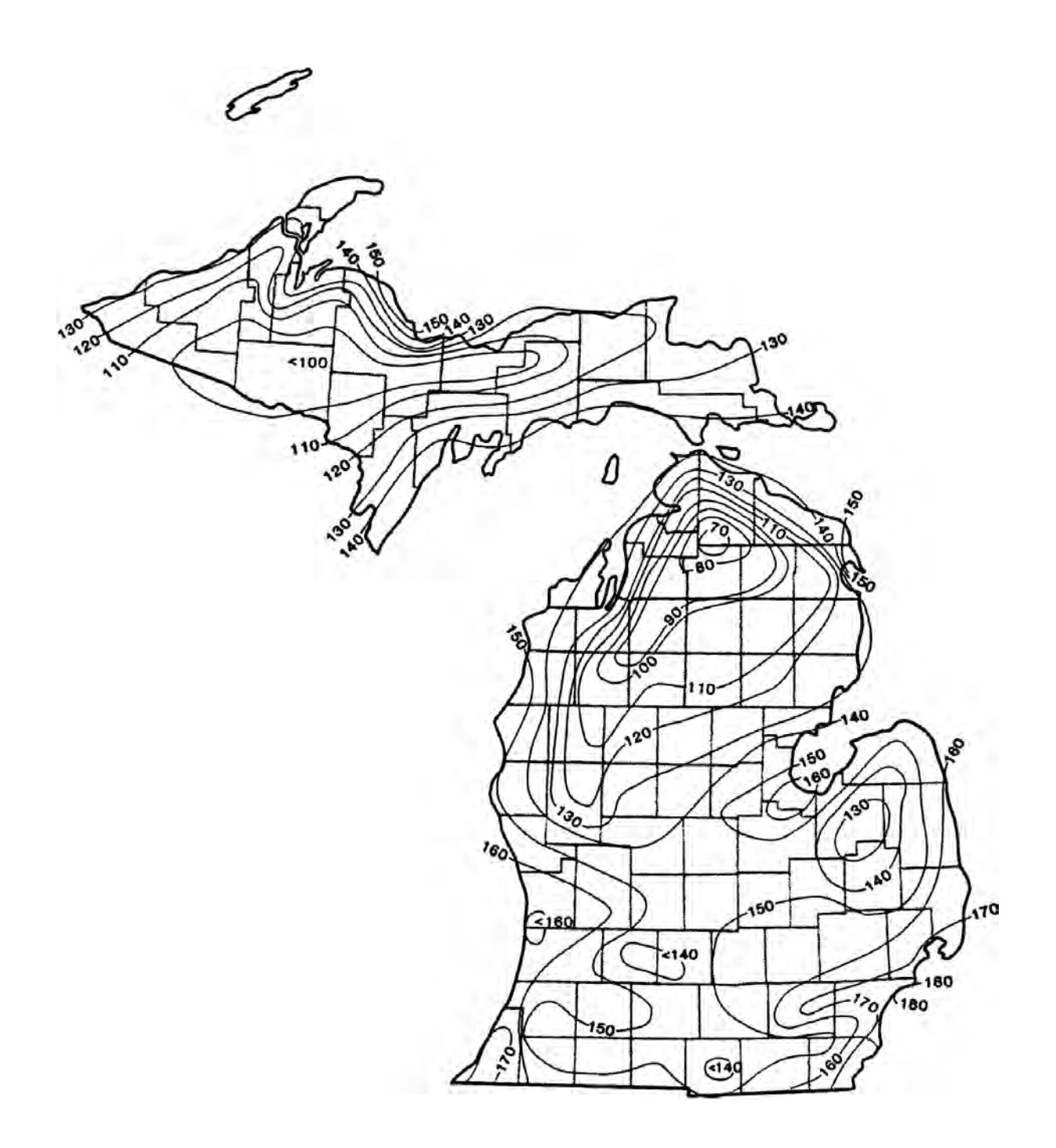
Figure 1.–Estimated average number of days between last spring and first fall 32° F occurrences during 1930–79 (Eichenlaub et al. 1990).