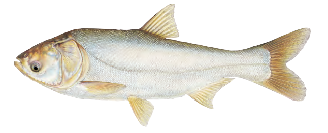
Silver carp Hypophthalmichthys molitrix