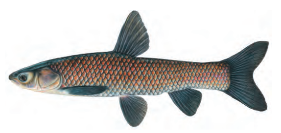
Black carp Mylopharyngodon piceus