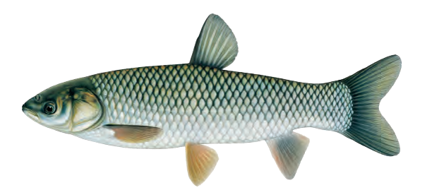
Grass carp Ctenopharyngodon idella