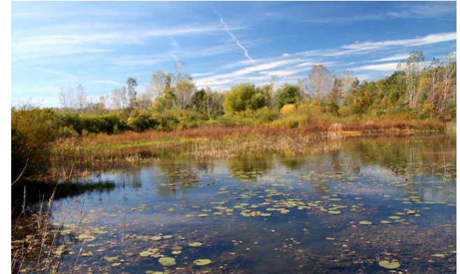
Note: this information taken directly from the Bass River State Recreation Area General Management Plan. The DNR Parks and Recreation Division provides a wide variety of other information online off the DNR website www.michigan.gov/dnr.

Bakale Wildlife Unit map (rev. 3/19/2012 - WLD/MLS)