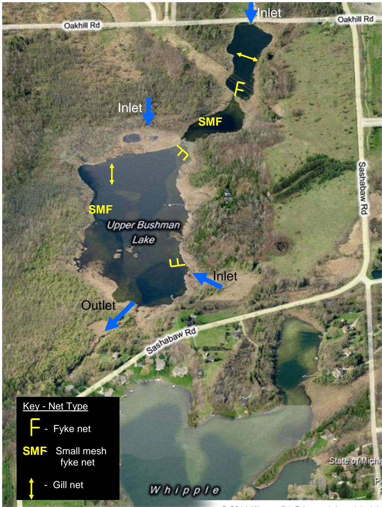
Figure 1.-Map of Upper Bushman Lake, including net set locations.