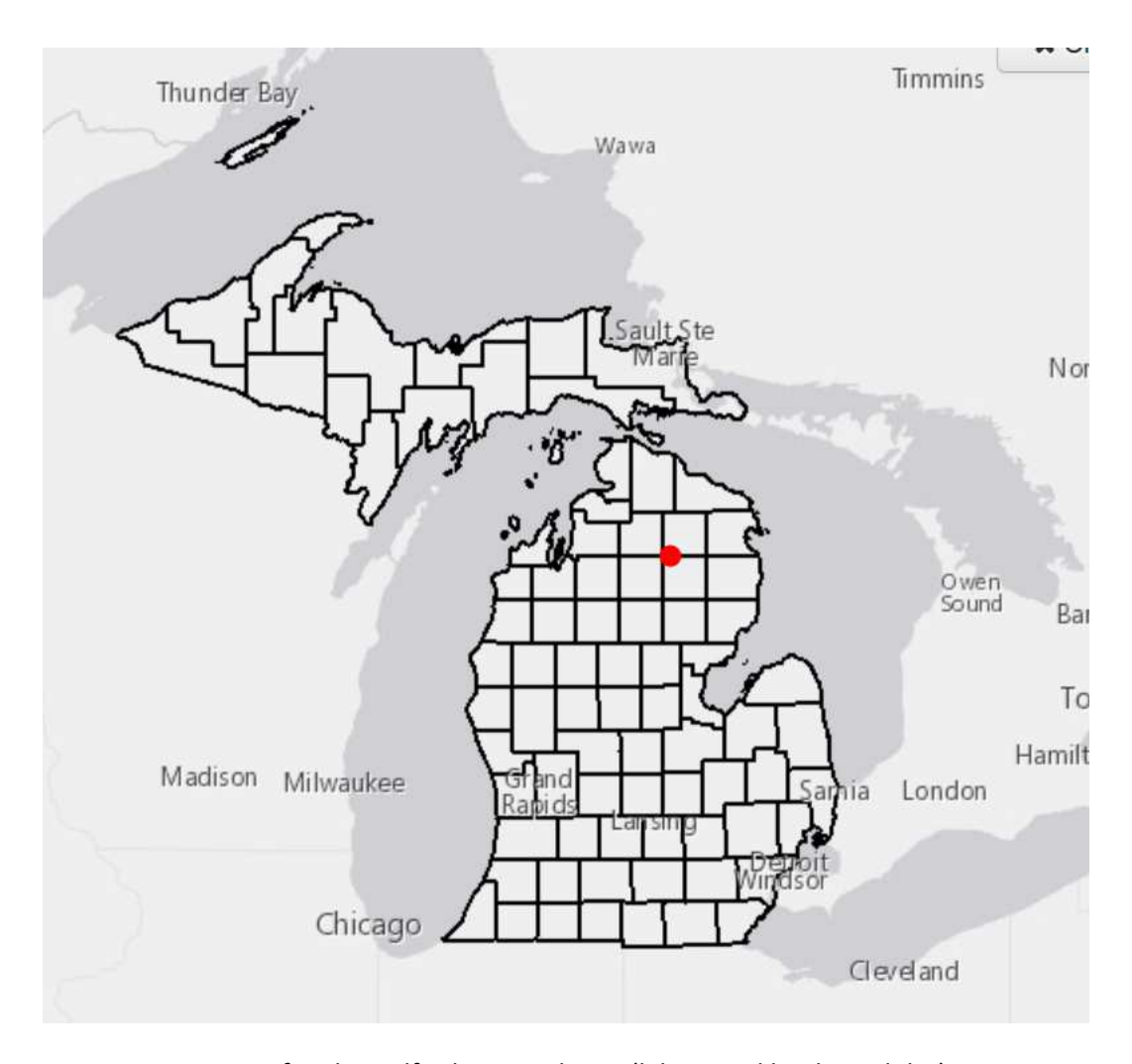
Figure 1. Location of Little Wolf Lake in Michigan (lake noted by the red dot).