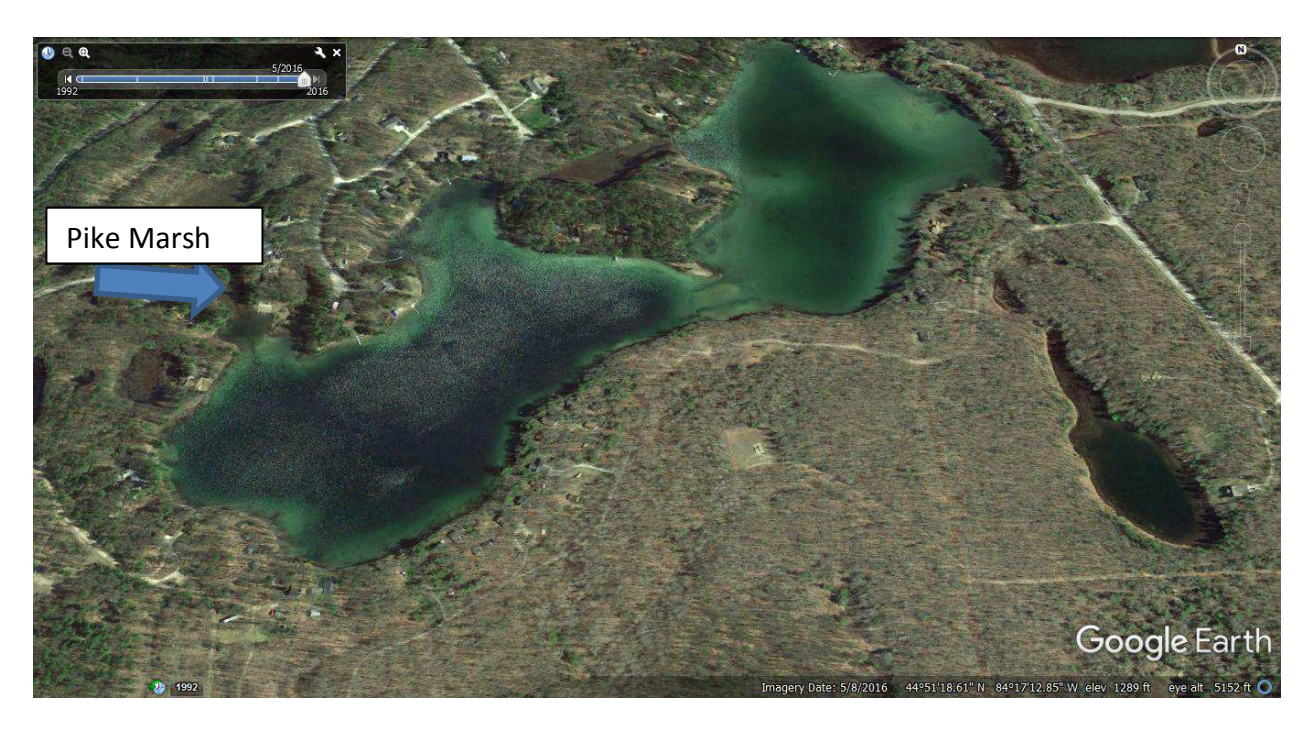
Figure 2. Aerial view of Little Wolf Lake, Montmorency and Oscoda counties, from satellite images.