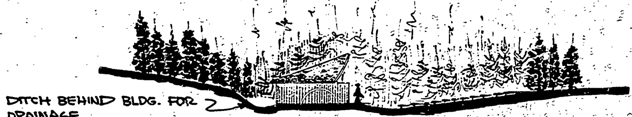
ELEVATION SCALE 1" = 20'

NOTE: THIS PLAN IS NECESSARILY SCHEMATIC DUE TO LACK OF TOPOGRAPHY MAPPING AND OTHER DATA. THE DESIGN INTENTMENT IS TO ALLOW FOR ON-SITE DECISIONS BY THE PROJECT ENGINEER.