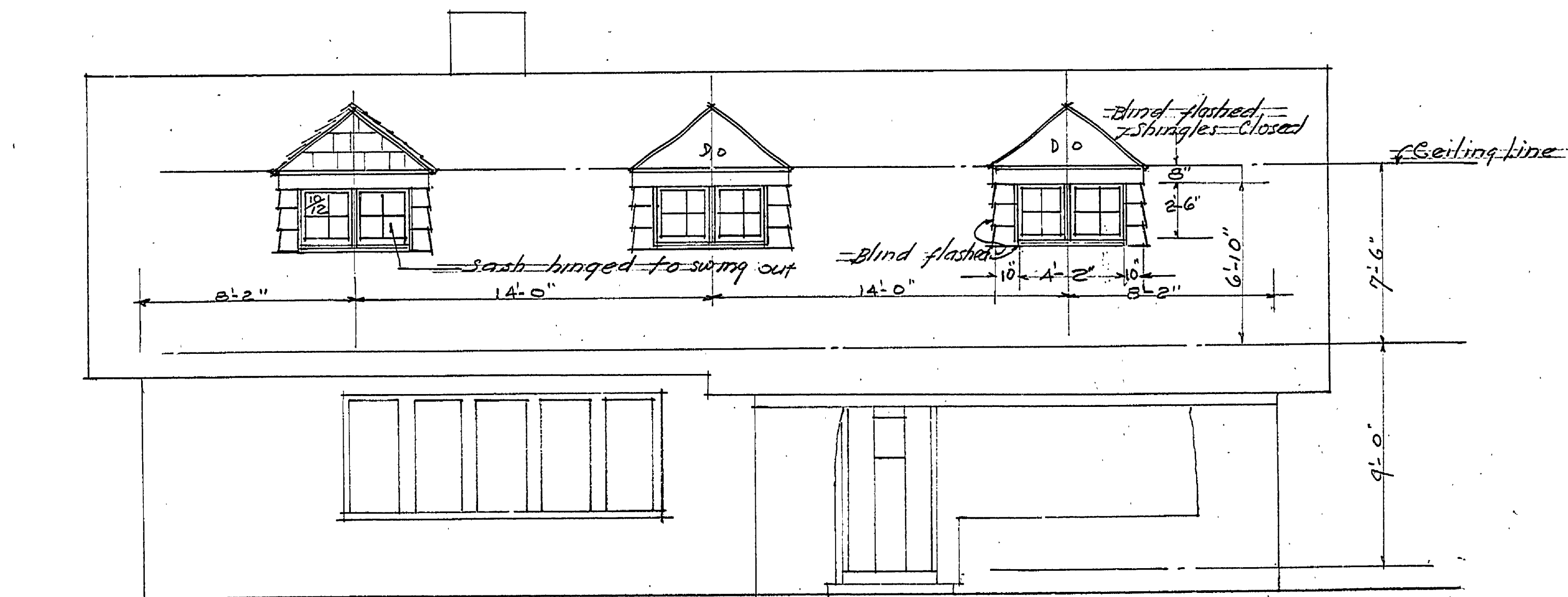
N. ORTH EAST (FRONT) ELEVATION