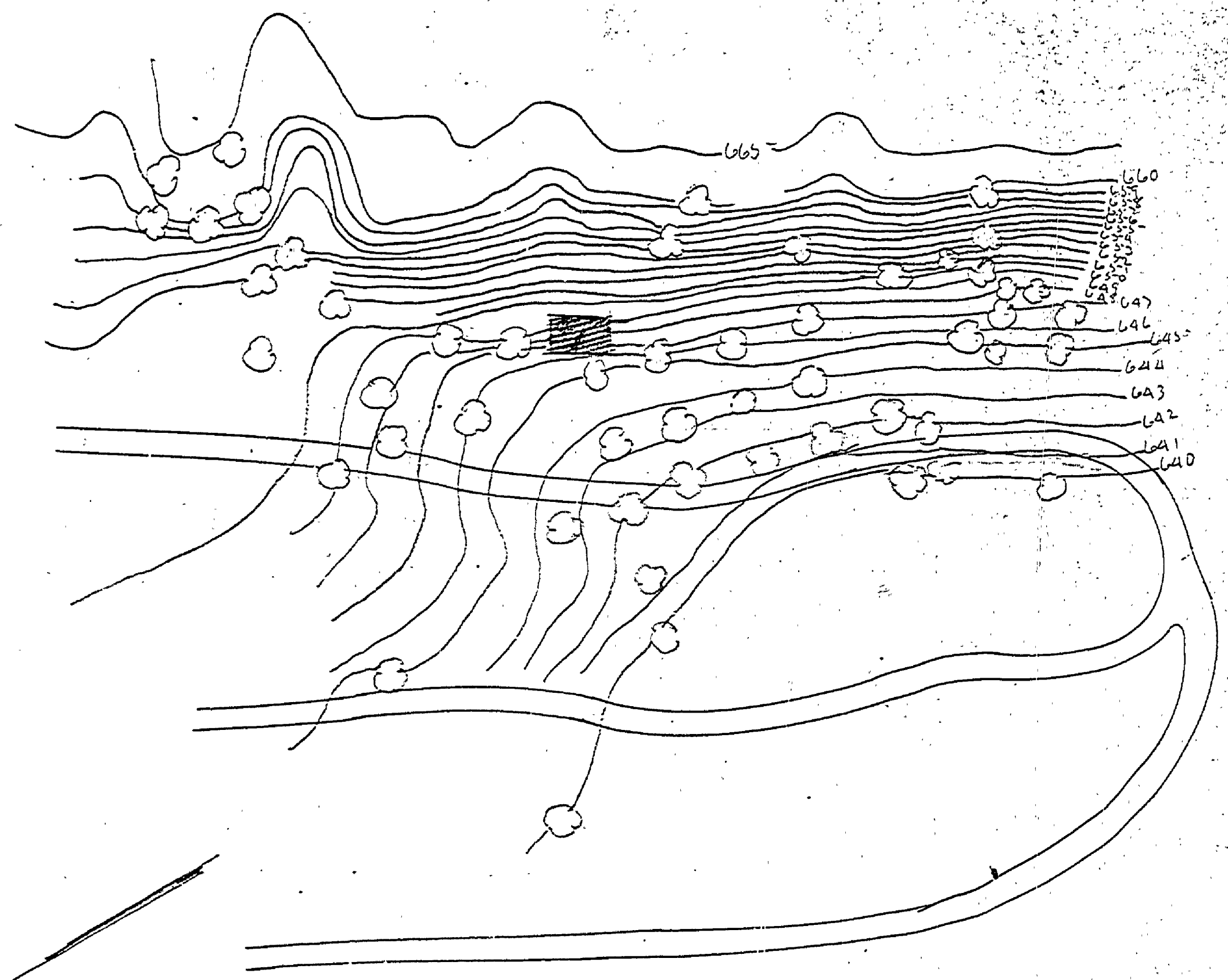
plot plan scale 1" = 50'

PROPOSED TOILET BUILDING for ORCHARD BEACH STATE PARK HUNTER, MICHIGAN P. BLICK proposed Emmet Hartland Architect Lansing, Mich.