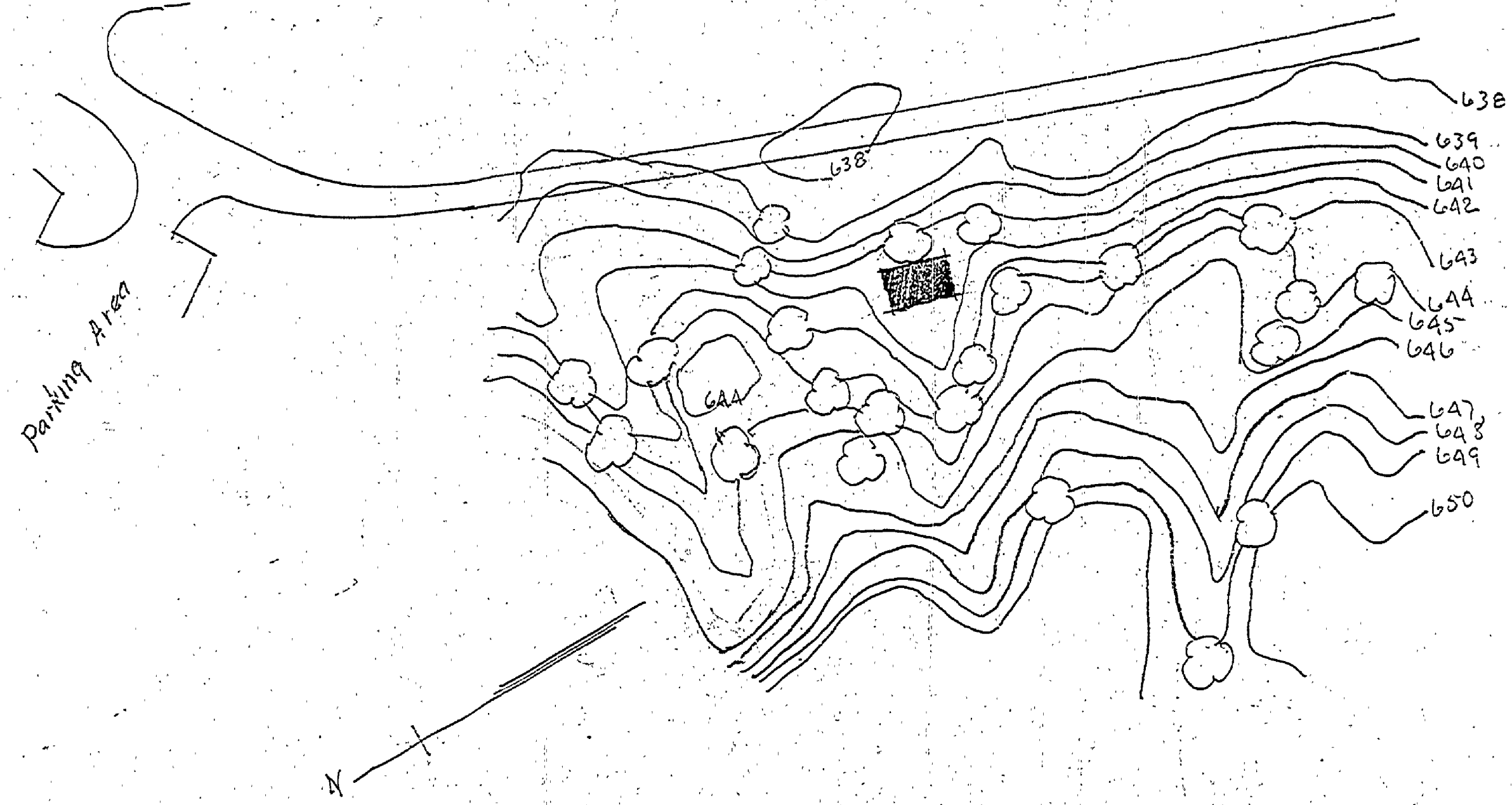
plot plan scale 1" = 50'